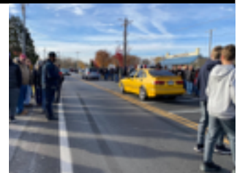
STREET SURVIVORS WELL REPRESENTED AT THE PIE RUN THANKSGIVING MORNING